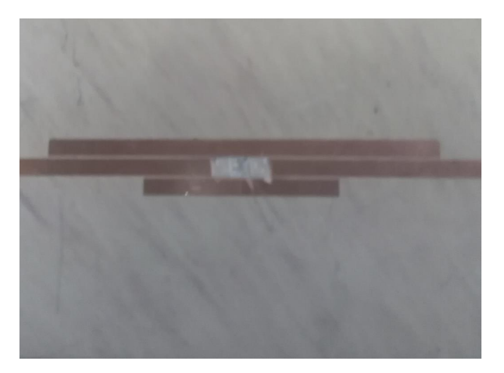
Fig. 1. Band-pass filter with "half-wave" and "wave" resonators connected in parallel

Here, \mathbf{T} is the transmission coefficient defined by formula (1), and D is the out-ofband decoupling, determined experimentally or calculated for each specific case, depending on the type of transmission line and magnitude of evanescent area.