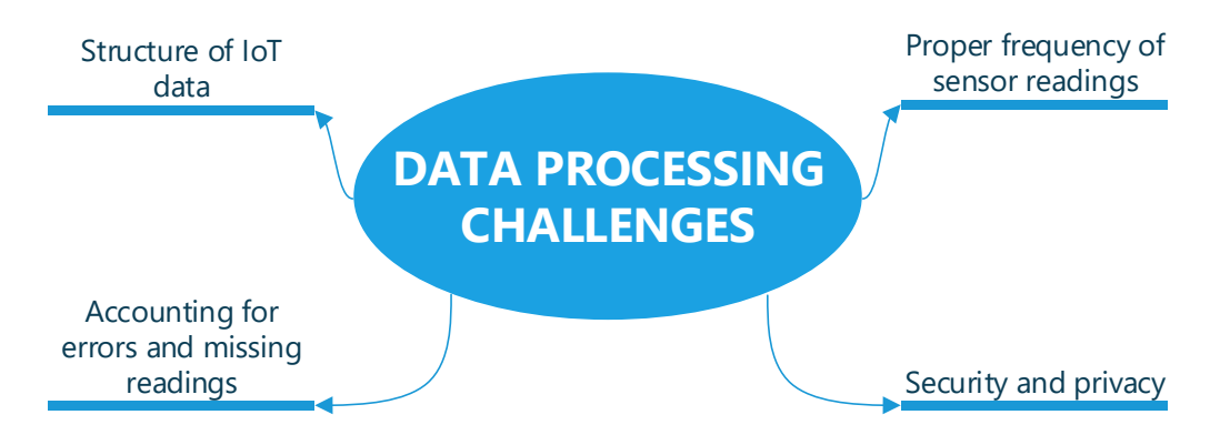
Fig. 1. IoT data processing challenges

Identifying challenges. The Internet of Things core idea can be summarized in one sentence: 'A worldwide network of interconnected entities'. In most cases, these entities, 'things' have a locatable, addressable, and readable counterpart on the Internet. They can open a communication channel with any other entity, providing and receiving services at any time, any place, and in any way. Many technologies serve as the building blocks of this paradigm, such as wireless sensor networks, cloud services, machine-to-machine interfaces, and so on. Also, this paradigm has a multitude of application domains, such as automotive, healthcare, logistics, environmental monitoring, and many others. And this heterogenous and dynamic nature is what makes developing efficient processing system a challenge. The main difficulties encountered in implementing stable and cost-effective IoT solutions can be divided into several groups: structure of IoT data, determining the proper frequency of sensor readings, accounting for errors and missing readings, security and privacy.